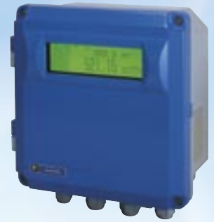
Flow Transmitter (Model:FSH)